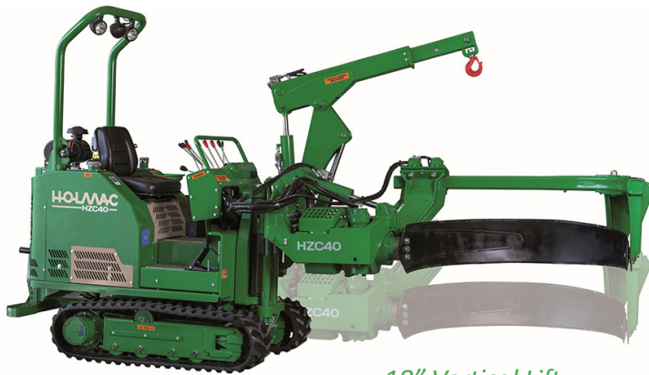
18" Vertical Lift

With the Treedigger HZC 40 you can dig out trees with rootballs from 16" to 55" of diameter. With the vertical lifting system you can lift the tree with its rootball out of the soil completely holding the tree in the vertical position. Comparing to the previous HZC 38, we are giving more attention to the worker, insulating totally the driverseat. (Optional Crane Available)